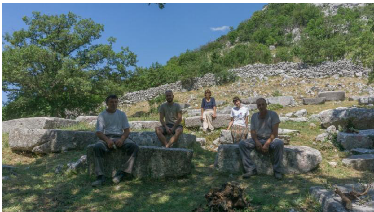
Photo: Dry stone artisans and volunteers taking a break after rebuilding a wall surrounding UNESCO protected medieval church with tombstones in Konavle, 2019