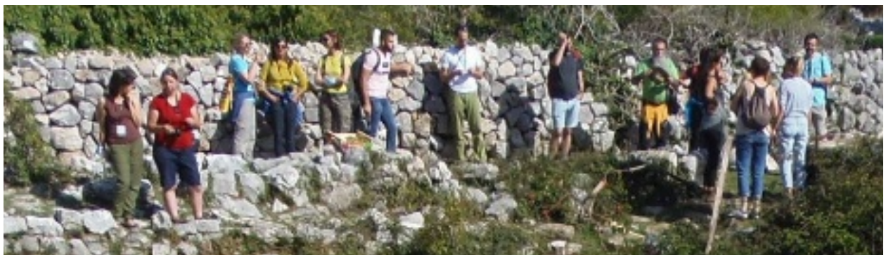
Field trip to Croatia (October 2021)